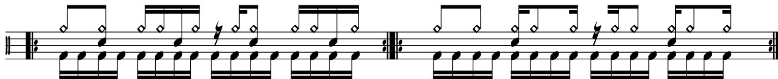
...double bass groove with double-time backbeat